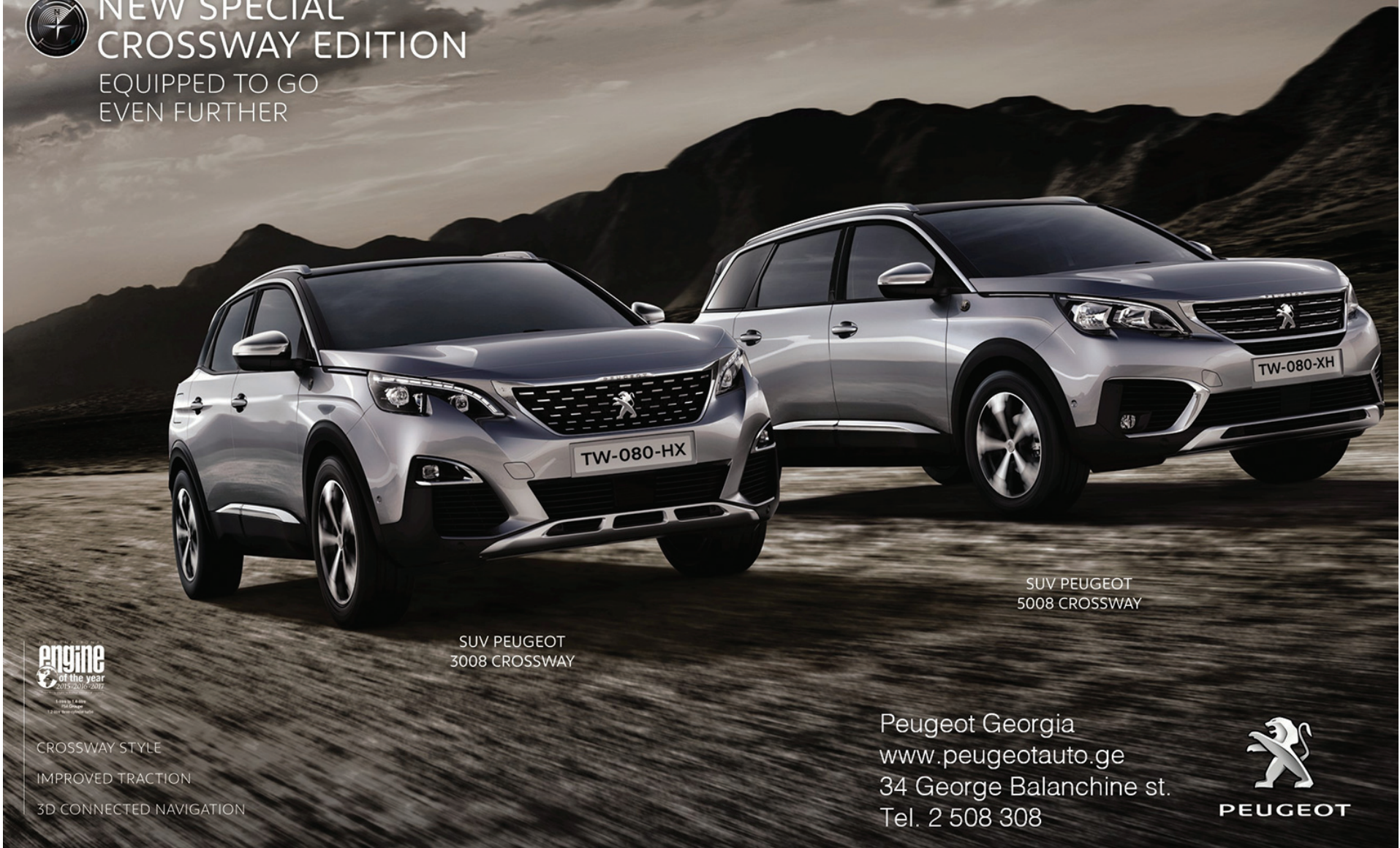
SUV PEUGEOT 3008 CROSSWAY